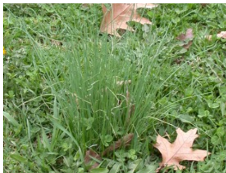
Wild Garlic – Allium vineale Wild Onion – A. canadense

Boat shaped leaf tips. Bunch type growth habit and a distinct membranous ligule.