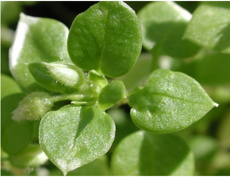
Common Chickweed – Stellaria media

Glabrous leaves are rounded at the base and pointed at the tip. Small white flowers with deeply notched petals.