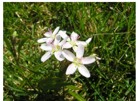
Hairy Bittercress – Cardamine hirsute

Garlic has hollow leaves, onion has flat leaves.