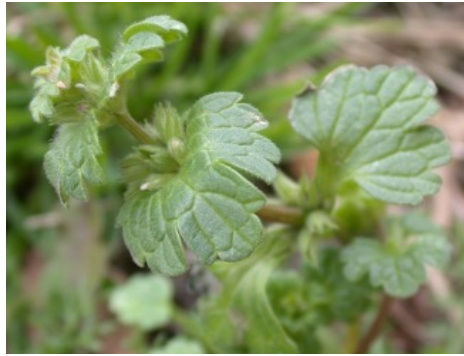
Henbit – Lamium amplexicaule

Glabrous leaves are rounded at the base and pointed at the tip. Small white flowers with deeply notched petals.