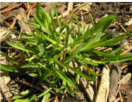
Annual Bluegrass – Poa annua

Boat shaped leaf tips. Bunch type growth habit and a distinct membranous ligule.