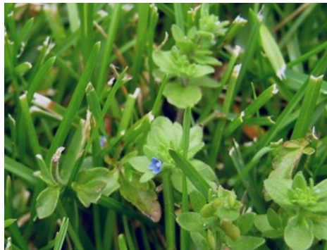
Corn Speedwell – Veronica arvensis