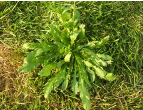
Shepard's Purse – Capsella bursa-pastoris

Long narrow siliques [seed pods] explosively disperse seed up to 10 feet. Alternately arranged round leaflets.