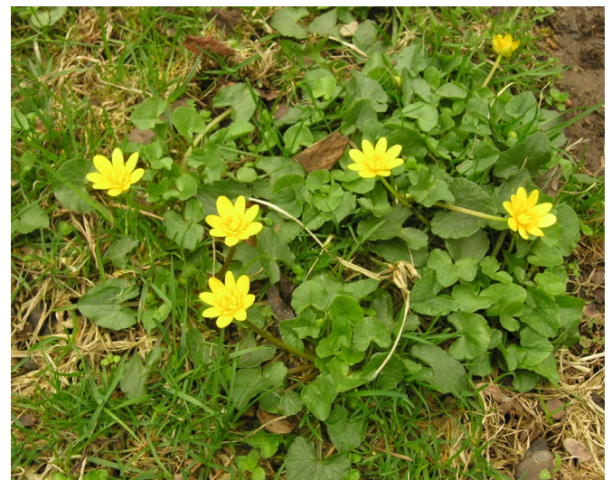
Figure 3. Lesser celandine is an invasive species that can spread into turfgrass. Selective control in turfgrass can be difficult.