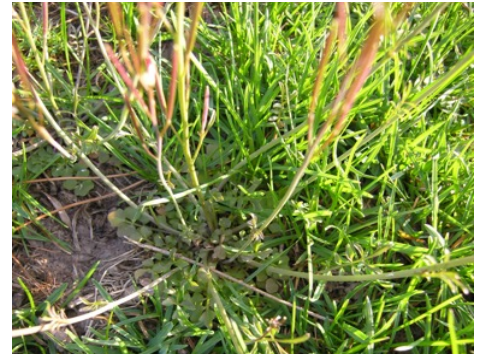
Hairy Bittercress – Cardamine hirsute

Square stems. Terminal leaves attached directly to main stem. Lower leaves on short branches.