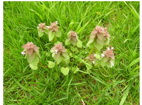
Purple Deadnettle – Lamium purpureum